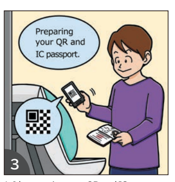
With preparing your QR and IC passport, you may go to the electronic declaration terminal at the customs inspection area of the airport.