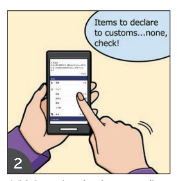
With inputting the data according to the guidance of the app, you may create your QR.