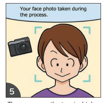
The camera on the terminal takes your face photo during the process at the electronic declaration terminal.