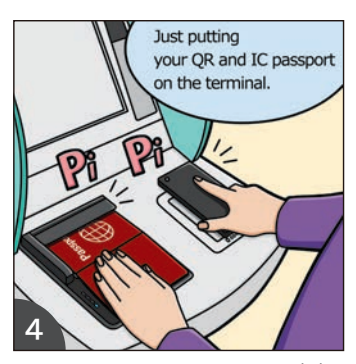
You may just put your QR and the photo page of your IC passport on the respective readers of the electronic declaration terminal