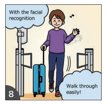
You can pass through the Gate smoothly with facial recognition.