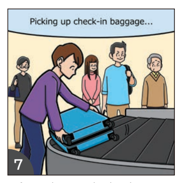
After picking up check-in baggage, you may walk to the Gate without waiting.