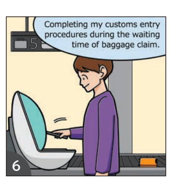
It is recommended to go through the procedures while waiting at the baggage claim.