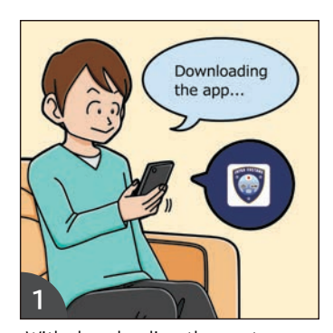
With downloading the customs declaration application in advance, you may complete customs entry procedures smoothly.